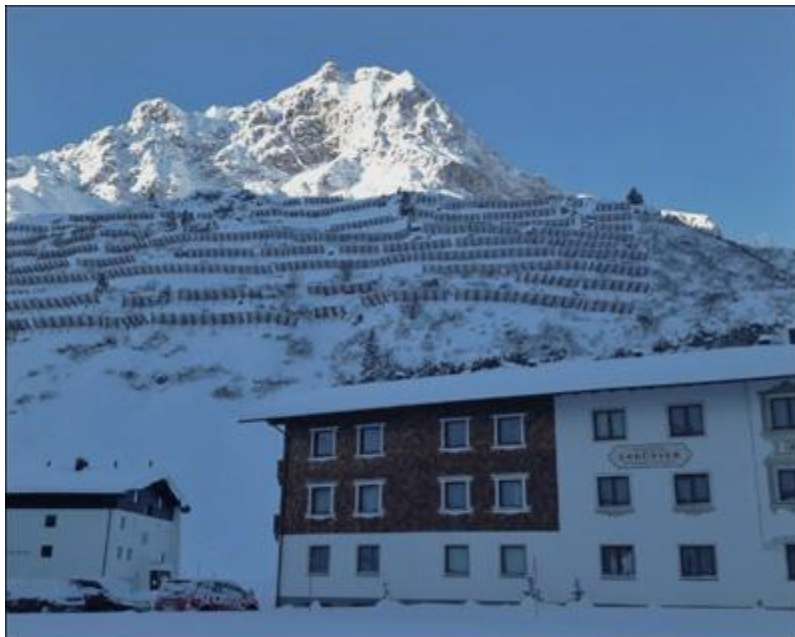
The sun illuminates the mountaintops as it rises over the town of Zuers.

In a snowy mountain town in Austria, 75 scientists met from 7-10 December 2012 for the 8th International Winter Conference on Alzheimer's Disease. They traded data and discussion of treatment approaches in the kind of cooped-up, homey atmosphere that brings down barriers when a diverse group of scientists stay together from breakfast until dinner to present, question, and debate science. (Yes, skiing in Zuers is great but, unlike in Keystone, the scientific program called for a daily 8 a.m. to 7 p.m. marathon, and the conference is so small that folks would notice if you played hooky on the slopes.) Started 10 years ago, this meeting is organized by Manfred Windisch of the contract research organization QPS, formerly JSW, in Graz, Austria, with help from Abraham Fisher and Ezio Jacobini . "The intention is to complement the big meetings with a small, interactive one where you can network and maybe start new projects," said Windisch.